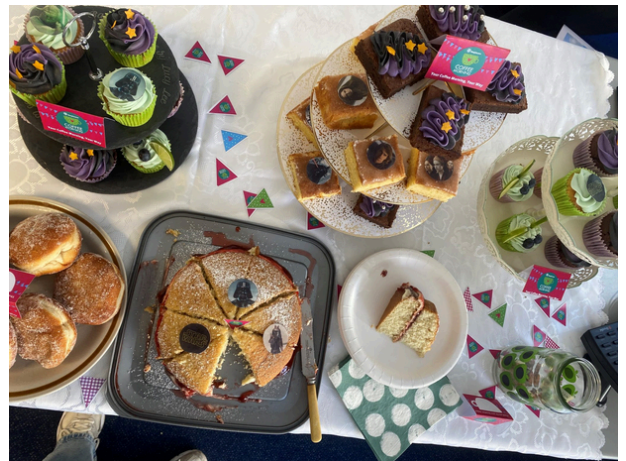
Bradleys held a Star Wars themed bake sale

For some time Hospiscare has been campaigning for fair funding from the Devon Integrated Care Board (ICB). Latest figures show that our hospice receives just 15% of its funding from the ICB, compared to a national average of 27%. This inequitable funding combined with soaring prices and a sharp dip in income from gifts in wills has resulted in the charity facing a £2.5 million deficit this year. We have already taken steps to tackle the shortfall, including reducing our administration costs and the number of beds on our ward from 12 to 8. More recently, in order to safe-guard the future of Hospiscare, we have made the difficult decision to replace our beloved Hospiscare at Home service with a new rapid response service. These are challenging times, but patient care is central to everything we do and we'll do everything in our power to always give the very best care. In all this, we'd like to say thank you to you, our 40 Club members, for standing by your local hospice.