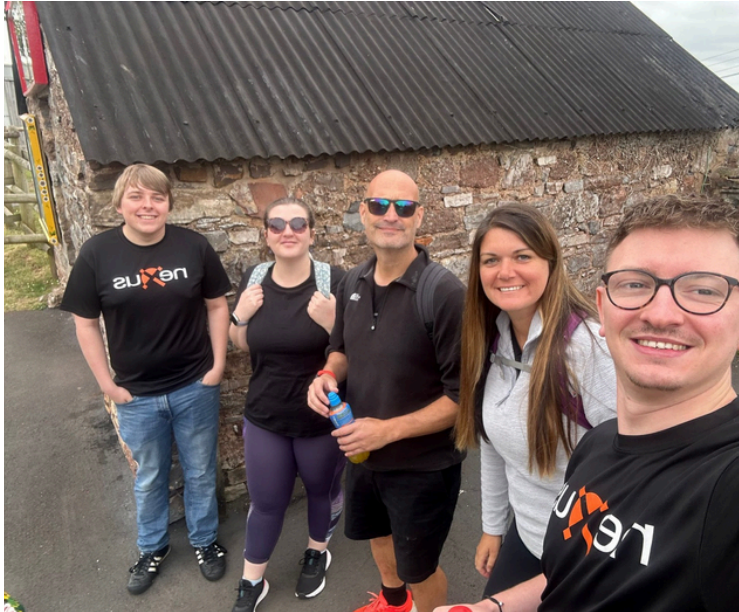
Nexus take on Tiverton's Grand Canal

Future editions of the 40 Club Newsletter will be winging their way to you every other month.